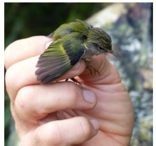
Threatened and protected species translocated back to the island and managed through researcher-practitioner partnerships include (from top to bottom): the hihi, elegant gecko, and the rifleman.