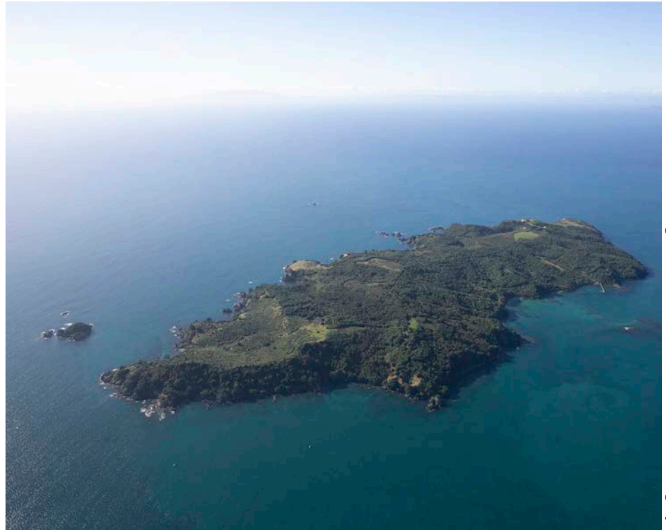
Tiritiri Matangi Island.