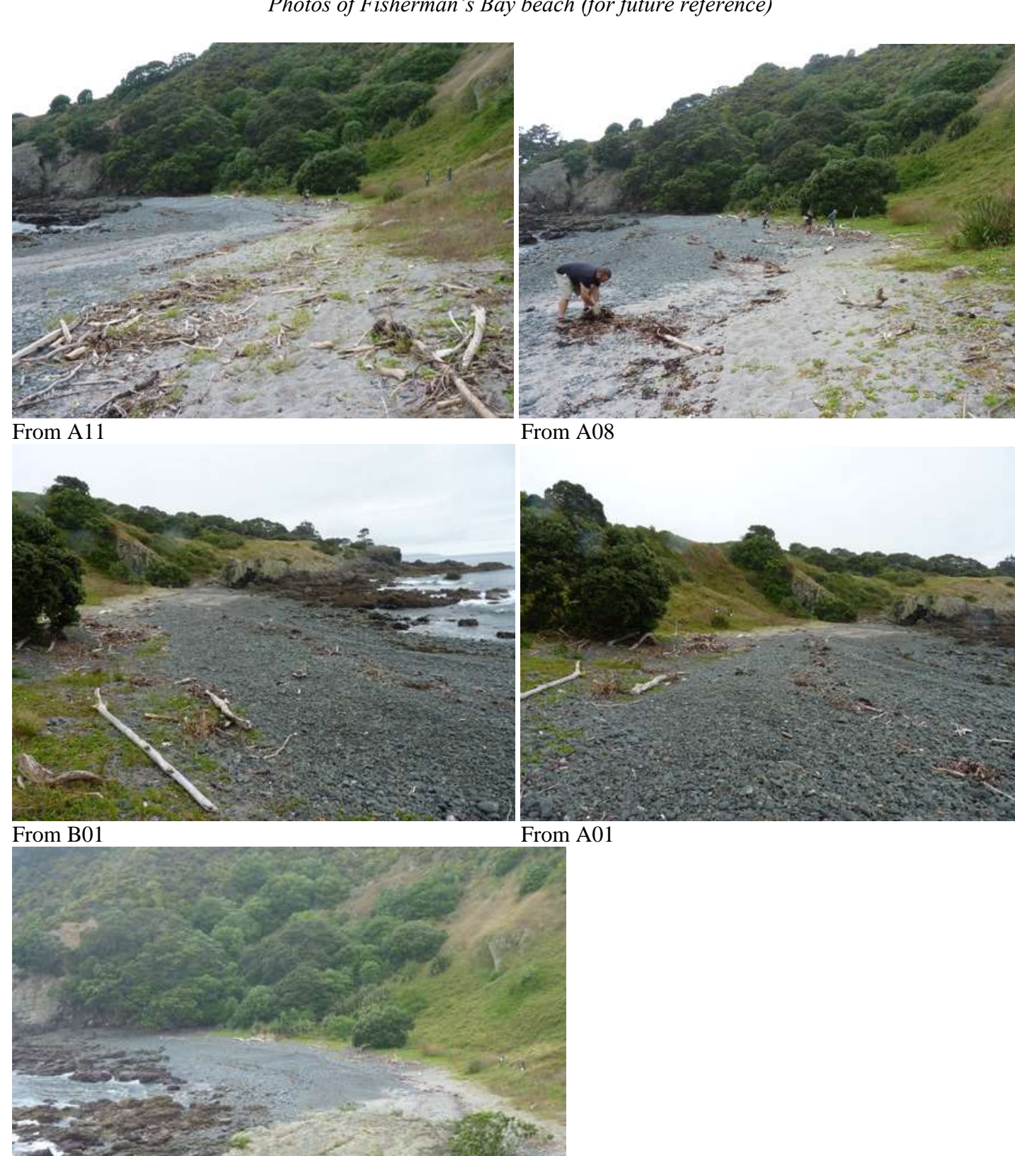
From bank north of beach